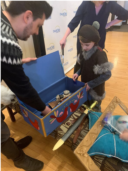
Brightside Theatre's Touch Tour

Tour. This allowed children to get a behind-the-scenes look and feel of the production of their production of Disney's Frozen, Jr. They were able to tour the stage and handle some of the props and costumes giving the children a more immersive experience.