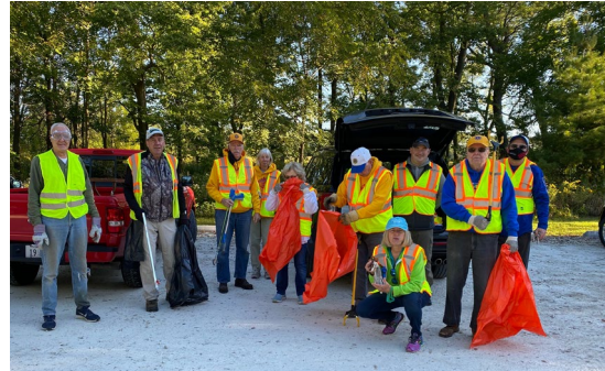
Lions cleanup crew

participated and made this section of road a little more picturesque.