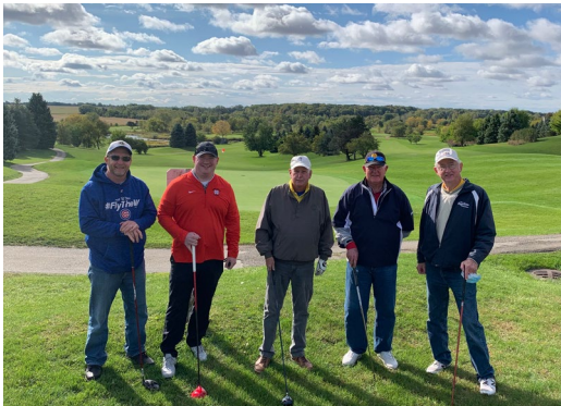
Beautiful day for golf

The annual District 1-J Golf Outing was held a little later than usual this year on October 1. We had a group of six golfers this year at Hughes Creek in Elburn. The weather was cool with spots of drizzle.