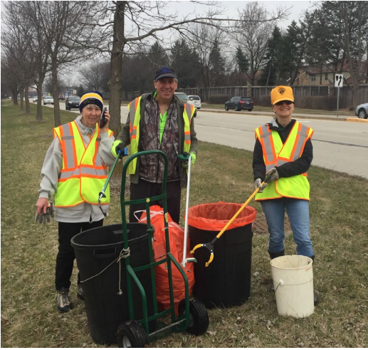
Lion Cleanup Crew